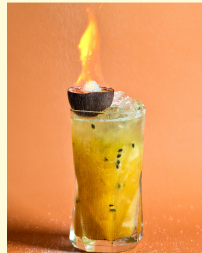
ALL NIGHT PASSION

Our VIP twist on the legendary Pornstar Martini with vodka, passionfruit and real vanilla.